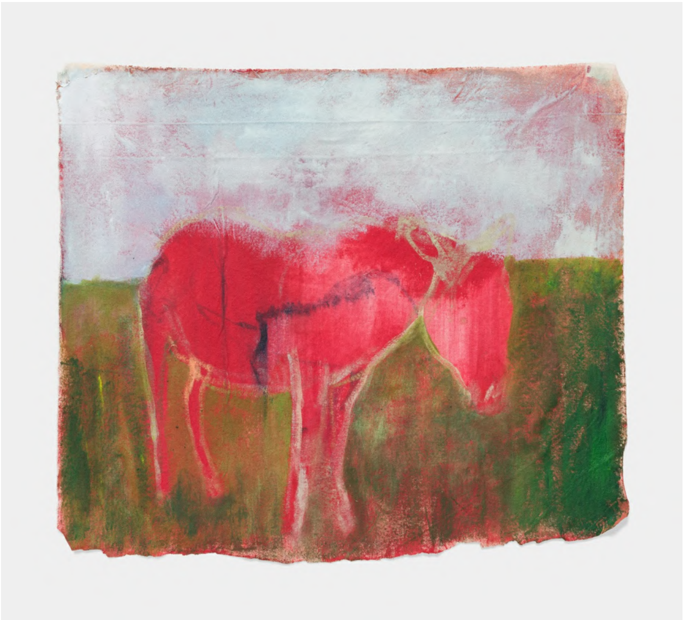
En Dan Weer Jy (And You Again) Mixed Media on Canvas, 2023 49 x 57 cm ZAR 8,000