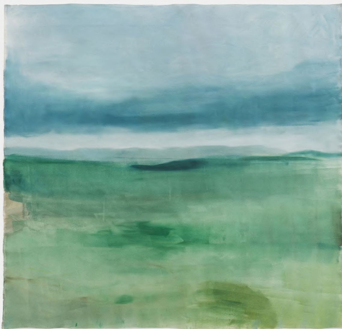
In a Flash Oil on Canvas, 2023 144.8 x 152.5 cm ZAR 50,000