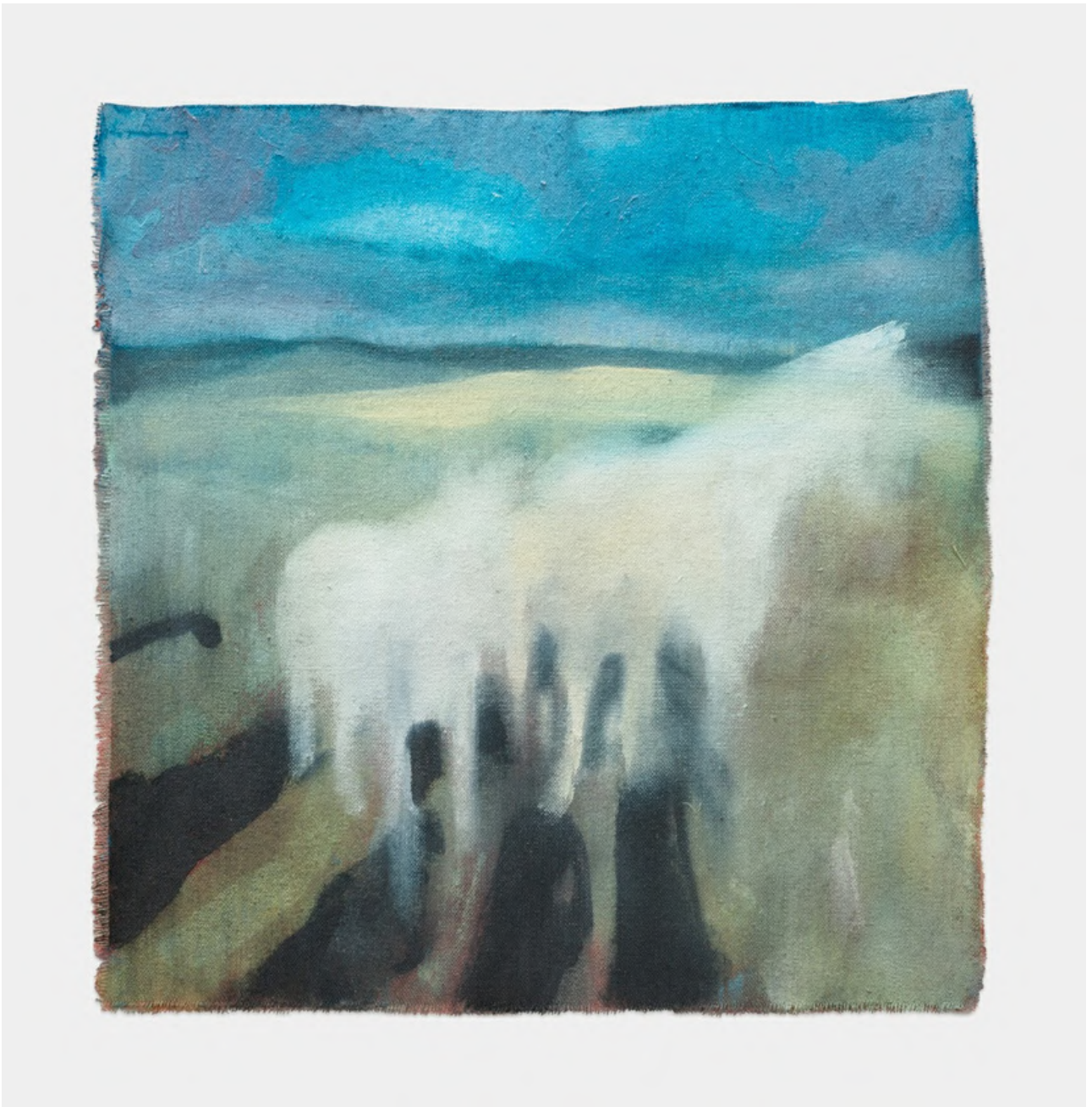
'n Besoeker (A Visitor) Oil on Canvas, 2023 29 x 29.5 cm ZAR 5,500