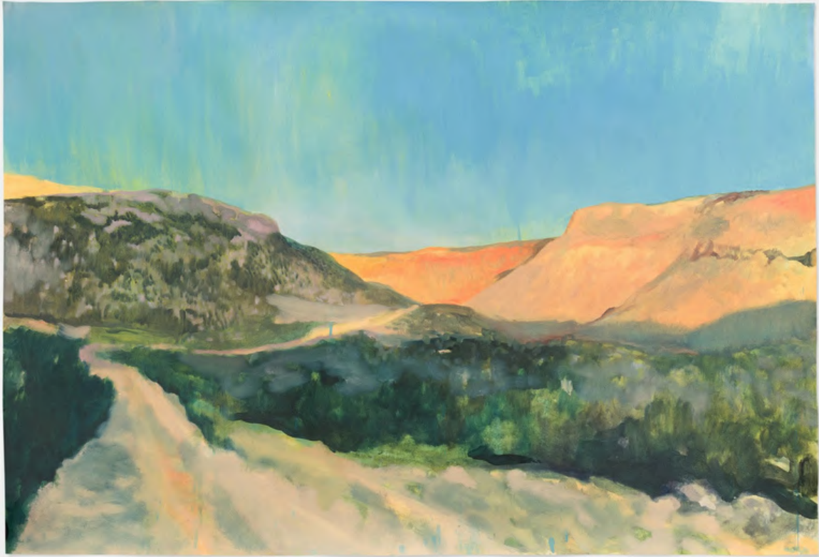
Nog Onlangs (Just Recently) Oil on Paper, 2023 102 x 152 cm Framed: 109.5 x 159 x 5.5 cm ZAR 45,000