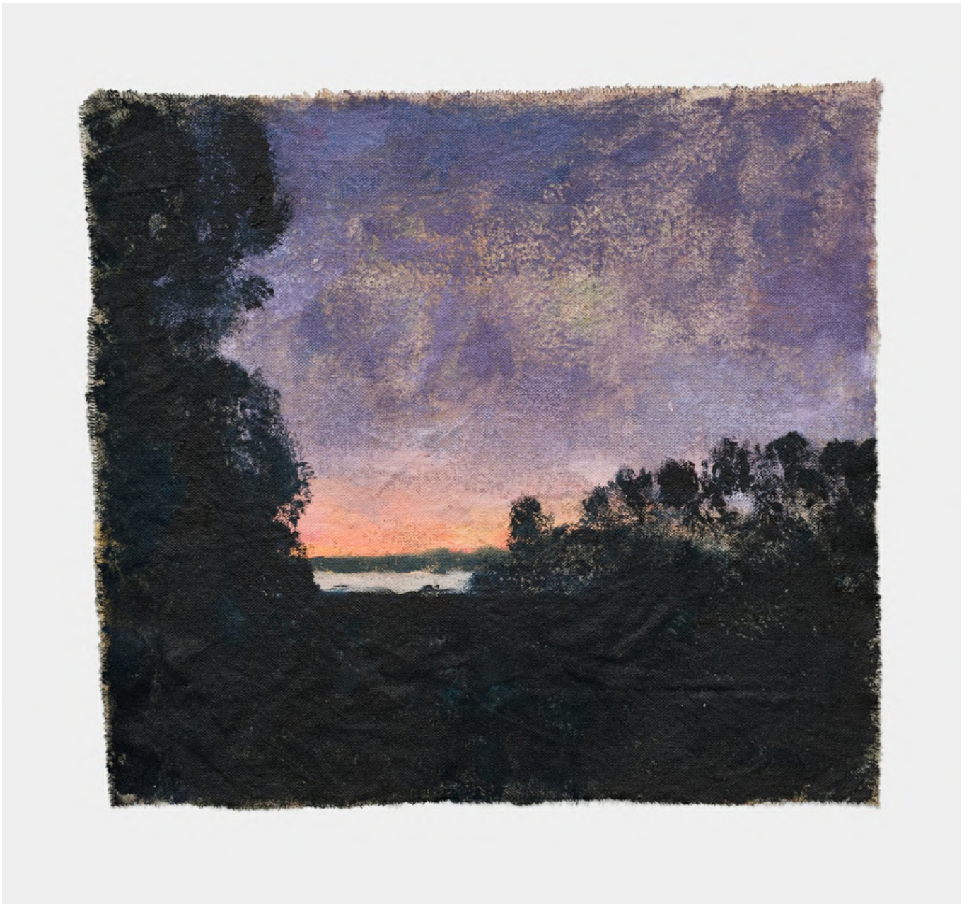
Ek Wou Jou Nog Sê (I Still Wanted To Tell You) Oil on Canvas, 2023 28 x 30.5 cm ZAR 6,500