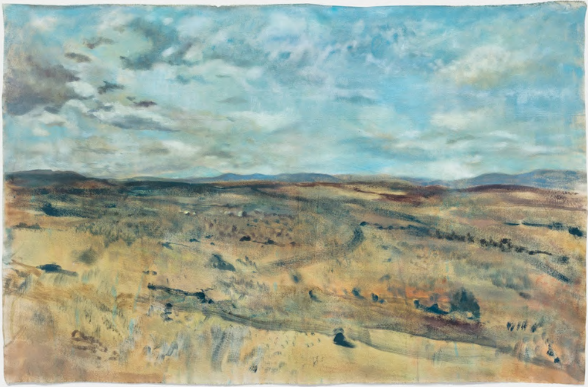
Ver Van Vergeet (Far From Forgetting) Oil and Acrylic on Canvas, 2023 100 x 154 cm ZAR 44,000