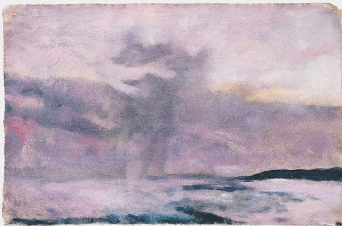
The Days Grew Old and Grey Oil on Canvas, 2023 32.5 x 50.5 cm ZAR 6,500