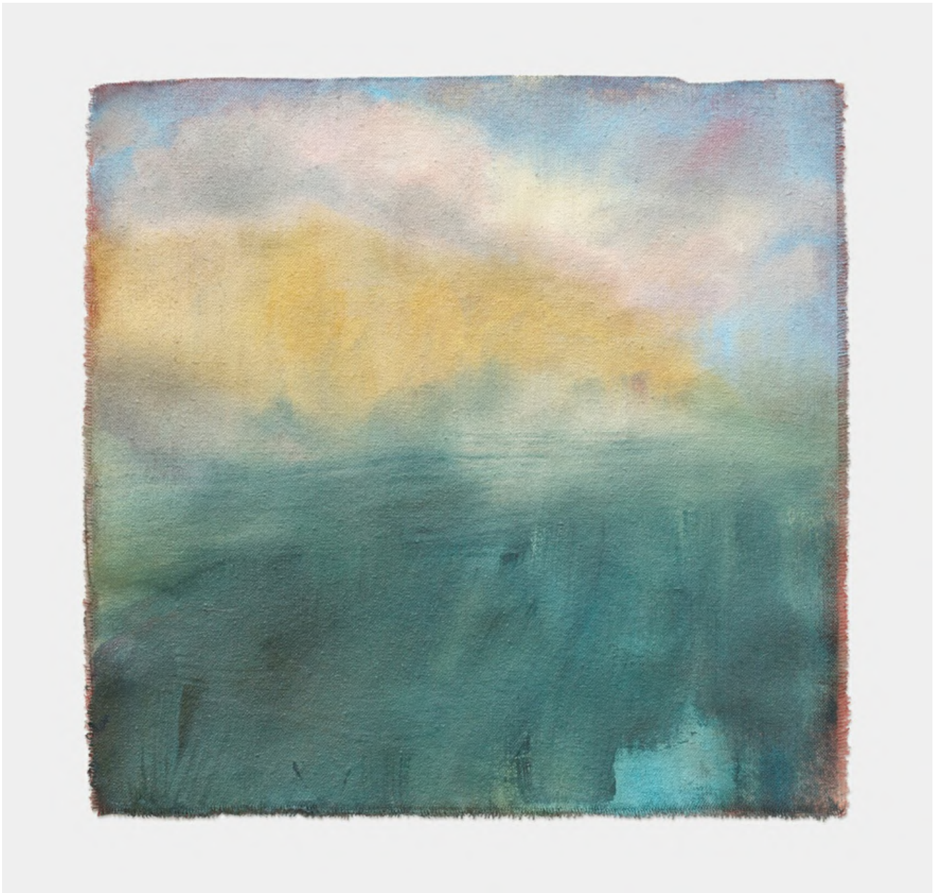
So Tydjie Terug (A Short While Ago) Oil on Canvas, 2023 28 x 28.5 cm ZAR 5,500