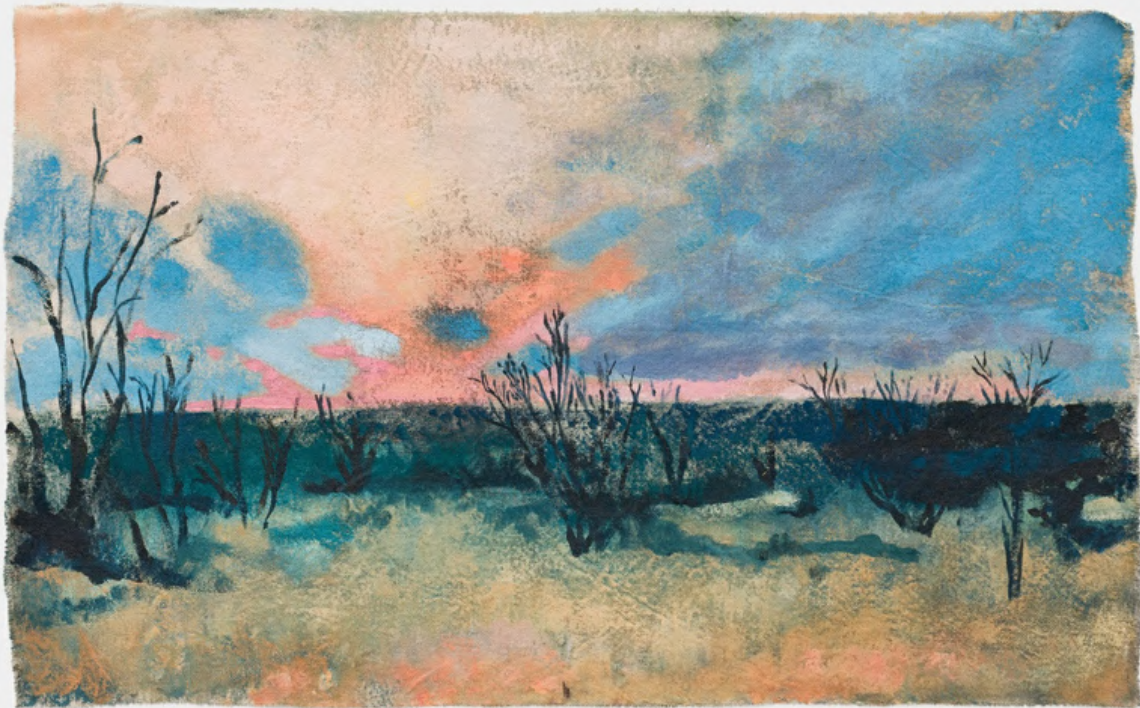
Onthou Jy Nog (Do You Still Remember) Oil on Canvas, 2023 31.5 x 51.5 cm ZAR 6,500