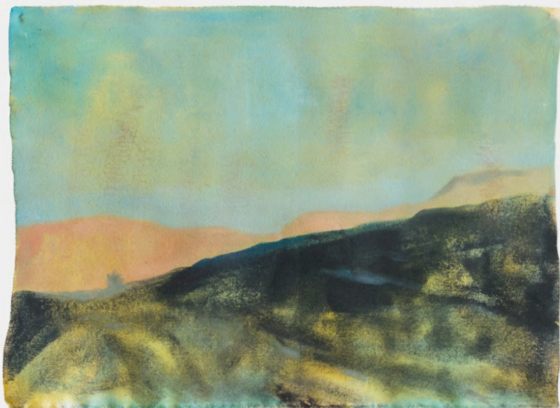
Daarheen (Over There) Oil on Canvas, 2023 41 x 57 cm ZAR 8,000