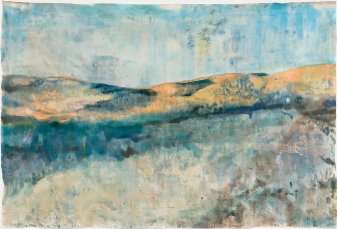
Nader Dwaal (Wander Closer) Oil and Acrylic on Canvas, 2023 100 x 154 cm ZAR 44,000