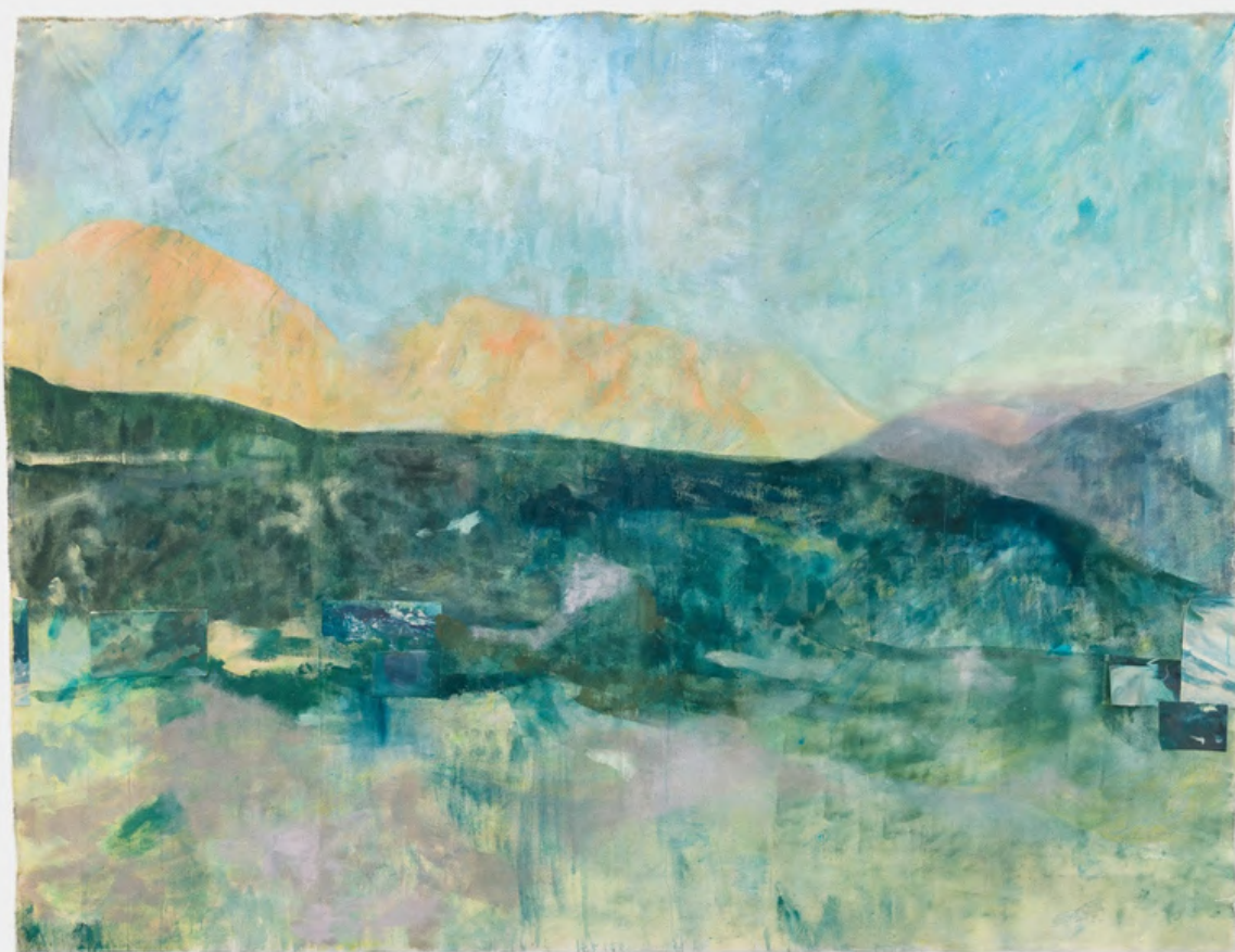
Sonstreeel (Stroking the Sun) Mixed Media on Canvas, 2022 156 x 204 cm ZAR 60,000