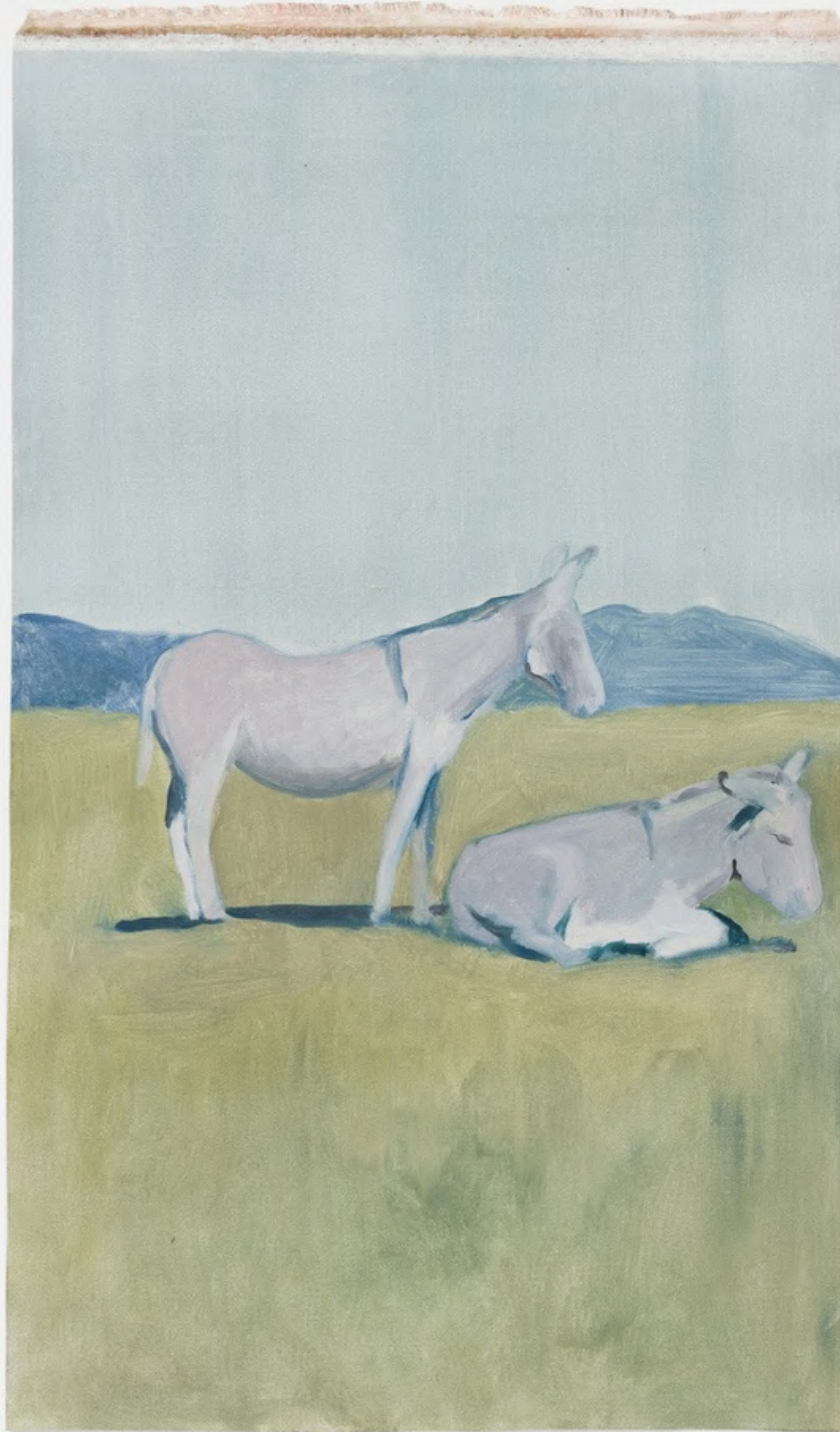
Cister Sag Soos Jy (Yesterday, Tender Like you)