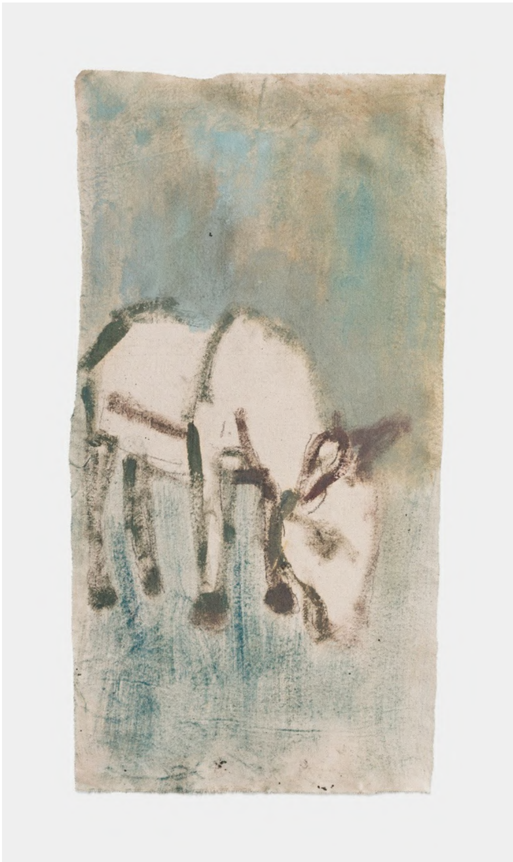
Kyk Vir Jou (Look At You) Oil on Canvas, 2023 55 x 28.5 cm ZAR 6,500