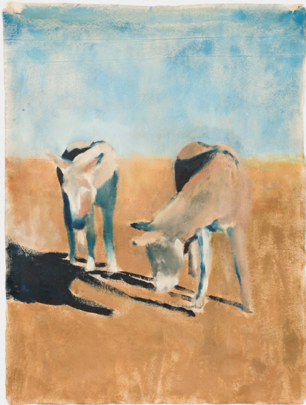
Terug Keer (To Return) Oil on Canvas, 2023 73 x 55.5 cm ZAR 9,000