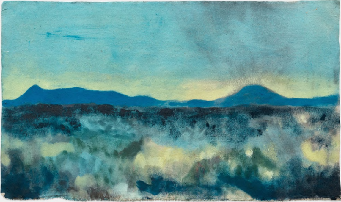
Skaars Daar (Hardly There) Oil on Canvas, 2023 32.5 x 55.8 cm ZAR 7,000