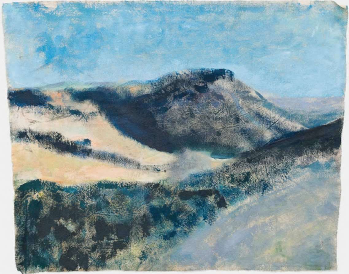
Kronkelpad (Winding Road) Oil on Canvas, 2023 46.5 x 60 cm ZAR 8,000