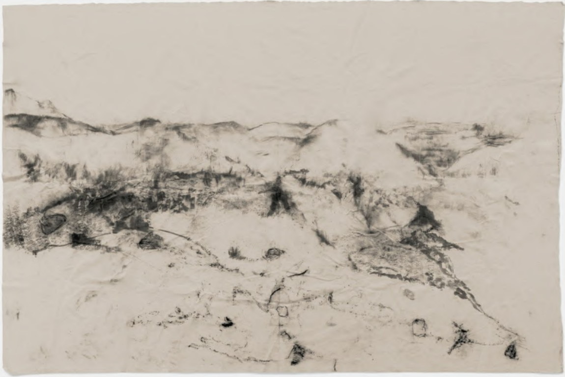
Ek Las Jou Aan Mekaar (I Bind You Together) Charcoal on Canvas, 2023 183 x 274 cm ZAR 60,000