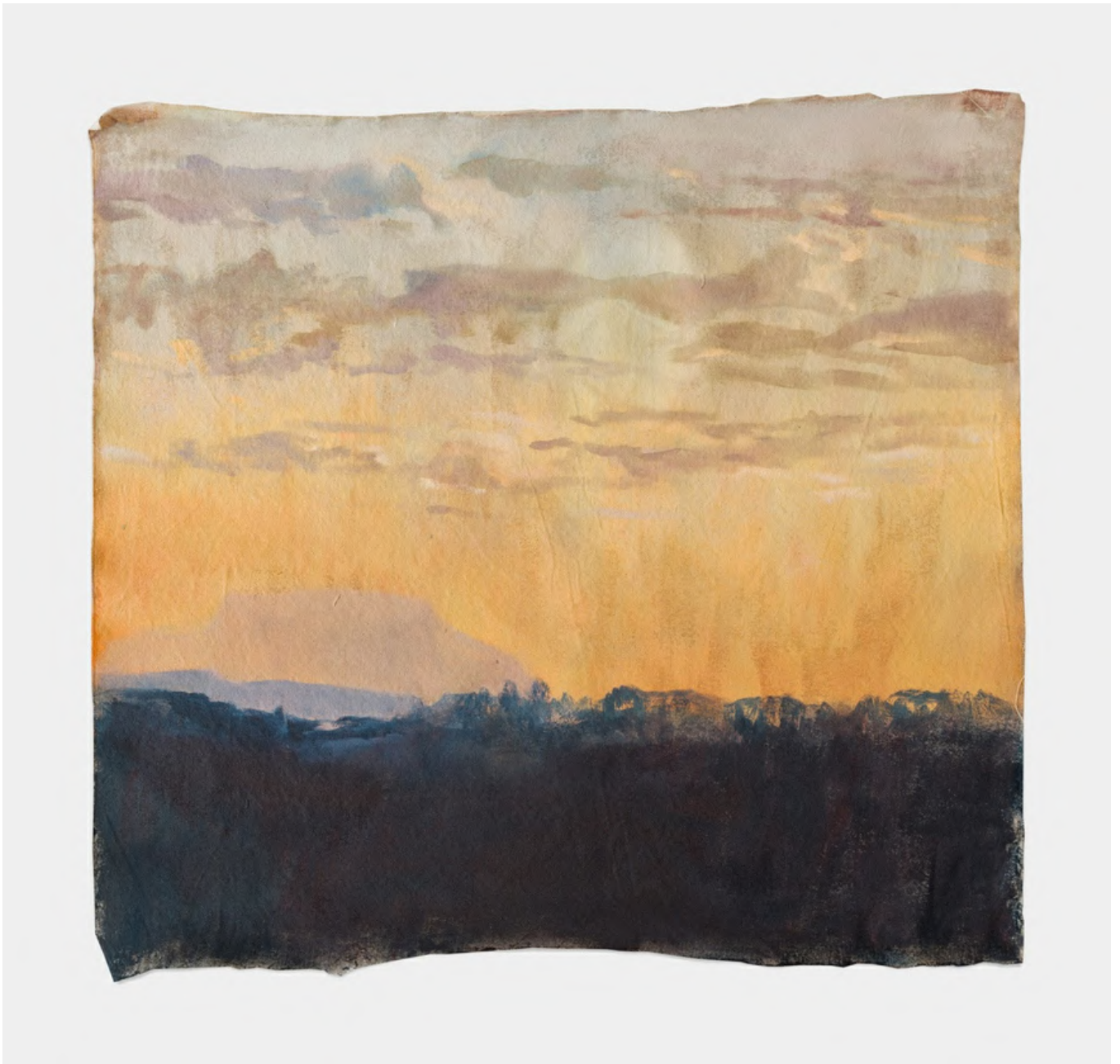
Ensovoorts (And So Forth) Oil on Canvas, 2023 52 x 57 cm ZAR 9,000