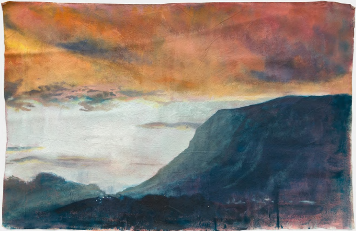
Alleen Alweer (Alone Again) Oil on Canvas, 2023 67.5 x 101.5 cm Framed: 69.5 x 103.5 x 5 cm ZAR 26,500