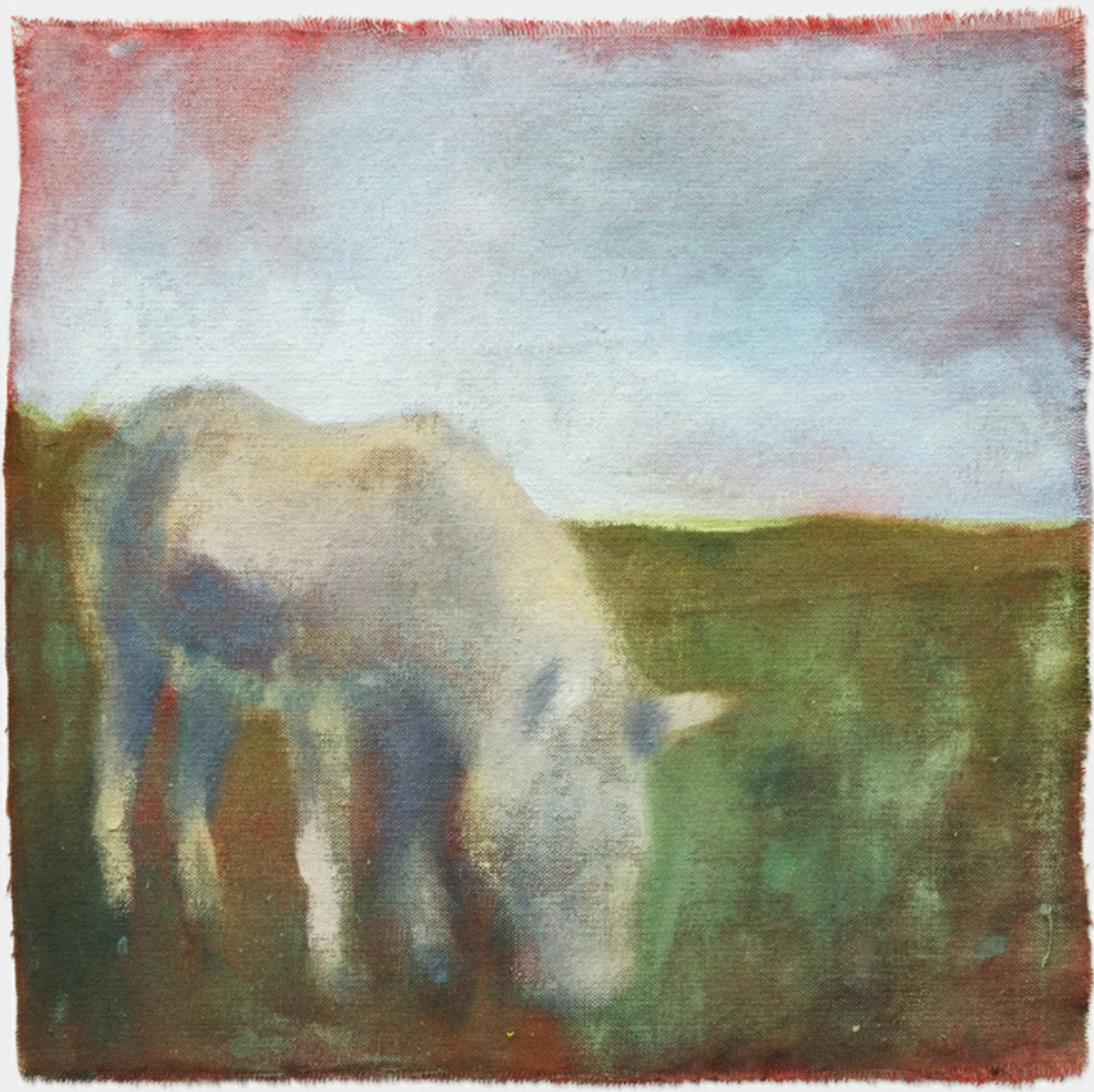
'n Kort Tydjie (A Short While) Oil on Canvas, 2023 29 x 30 cm ZAR 5,500